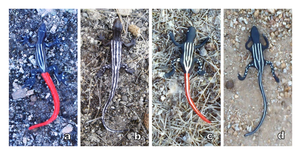
Fig. 1 Types of models used in the study: a red-tailed plaster model (tail completely red), b striped-tailed plaster model (dark and light banded tail pattern), c red-tailed plasticine model (red tail with a light band on the back), and d striped-tailed plasticine model (dark and light banded tail pattern). (Color figure online)